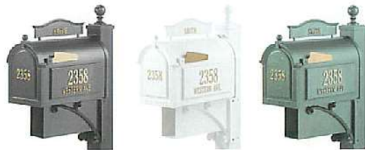
Black Item #16305