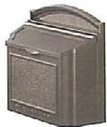
French Bronze Item # 16138