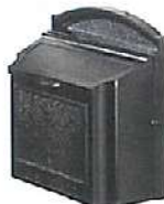
Black Item #16140