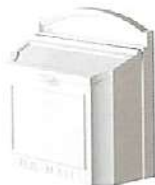
White Item #16139