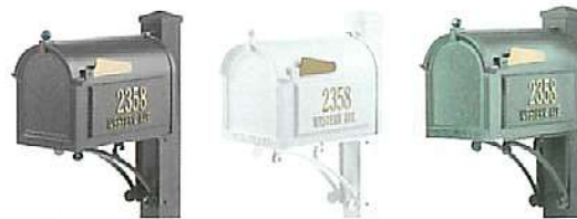
Black Item #16308