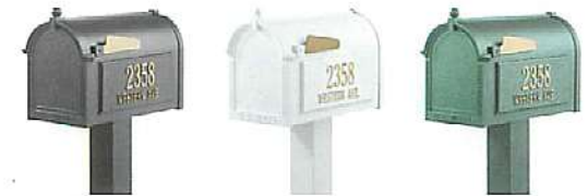
Black Item #16311